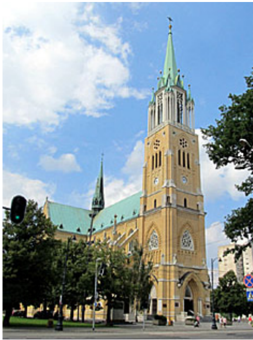
St. Stanislaus Kostka Cathedral Church in Łódź