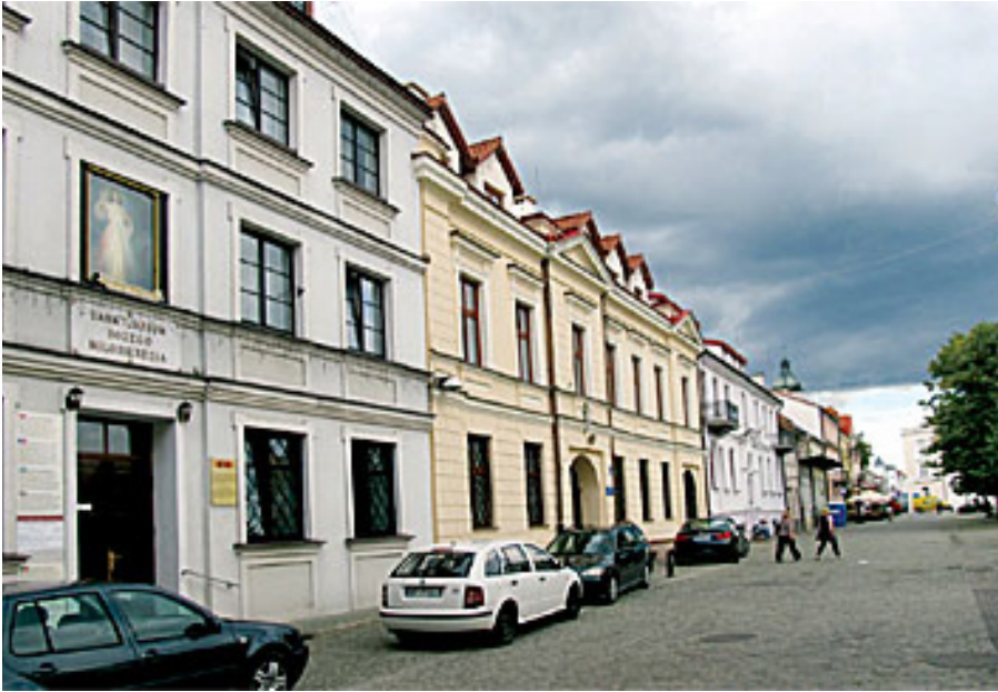
The house of the Congregation of the Sisters of Our Lady of Mercy in Plock, where Lord Jesus ordered Sister Faustina to paint the image of Him.

Third, initiating the apostolic movement of Divine Mercy whose devotees and apostles shall bring about a religious renewal among the faithful in the spirit of this devotion, namely, acquiring an attitude of childlike trust in God and actively living the commandment of love and mercy toward one's neighbor.