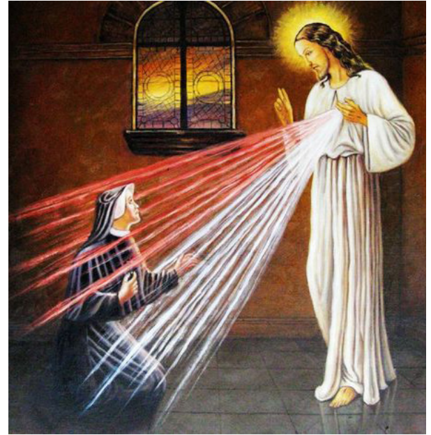
St. Faustina receives a vision of Jesus

The original image was hidden away and the devotion banned in 1959 because incorrect grammar changed the meaning of certain phrases in the translated text of the Diary of St Faustina. This is the devotion for our time.