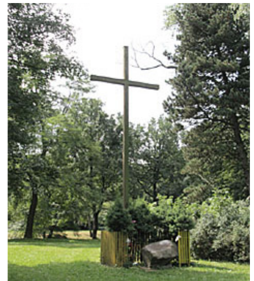
Wenecki Park in Łódź – the dance site

It was almost twilight; there were only a few people in the cathedral. Paying no attention to what was happening around me, I fell prostrate before the Blessed Sacrament and begged the Lord to be good enough to allow me to understand what I should do next. Then I heard these words, “Go at once to Warsaw (Poland), you will enter a convent there” . I rose from prayer, came home and took care of things that needed to be settled. As best I could, I confided to my sister what took